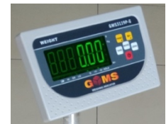
GMS3119P-G (Green LED display)