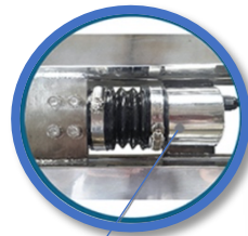
Water Proof Load Cell Cover