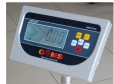
GMS3119P-B (LCD display with Backlight)