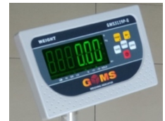
GMS3119P-G (Green LED display)