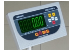
GMS3119P-G (Green LED display)