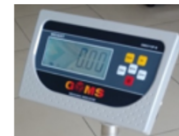
GMS3119P-B (LCD display with Backlight)