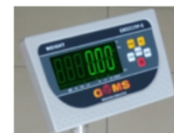
GMS3119P-G (Green LED display)