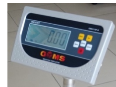
GMS3119P-B (LCD display with Backlight)