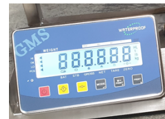
GMS3119WP (LCD display with Backlight)