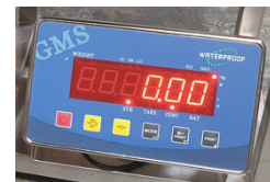
GMS3119WM (Red LED display)