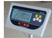
GMS3119P-B (LCD display with Backlight)