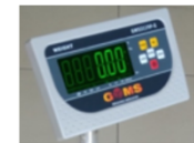
GMS3119P-G (Green LED display)