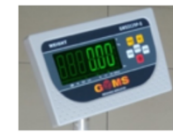
GMS3119P-G (Green LED display)