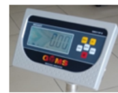
GMS3119P-B (LCD display with Backlight)