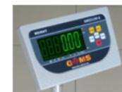
GMS3119P-G (Green LED display)